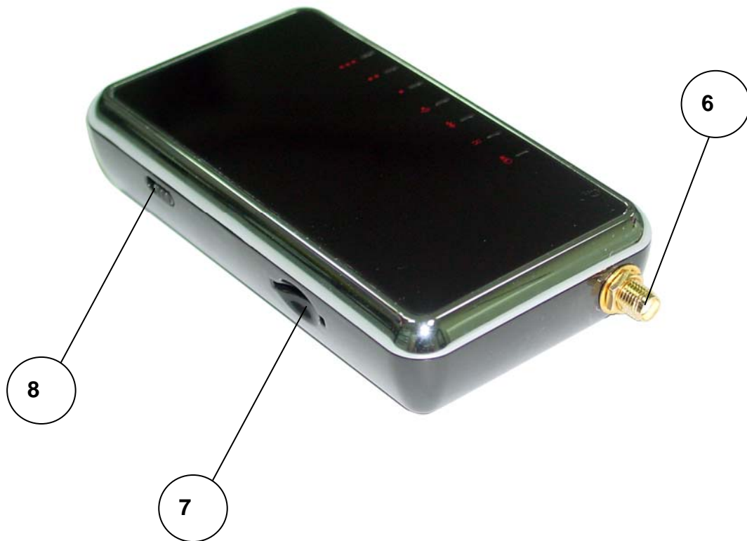
Fig. 2 Rear View of 3G/EDGE Super Modem/Router

For more detailed description, please refer to the Section 2.2 and Section 2.2.2.